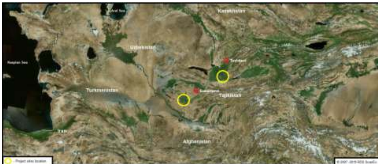
Map 1.1: Project location