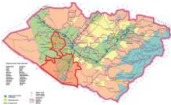
Map 1.1: Project location – Kashkadarya region

The GoU has allocated to FE “Indorama Agro” LLC 54,196 ha of cotton land in Kashkadarya and Syrdarya regions (Map 1.1) for direct farming under a lease agreement for 49 years.