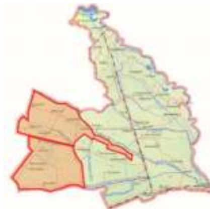
Map 1.2: Project location – Syrdarya region